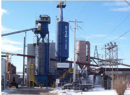
Dynamotive Energy Systems Corporation facility, West Lorne, Ontario, Canada.

Dynamotive Energy Systems Corporation is an energy solutions provider headquartered in